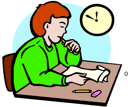
Grade 7 & 8 Core French will now have an examination in January and June

This evaluation descriptor will be implemented for the rest of this school year. Students in Grade 7 & 8 Core French will now have an examination in January and June.