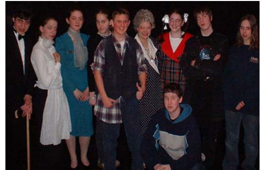
The Cast and Crew of, “He Done Her Wrong or Wedded but no Wife” after their performance and adjudication at the Avalon East High School Drama Festival.

(The play will be performed one final time this year at the spring concert on May 28. Come out and see the show!!)